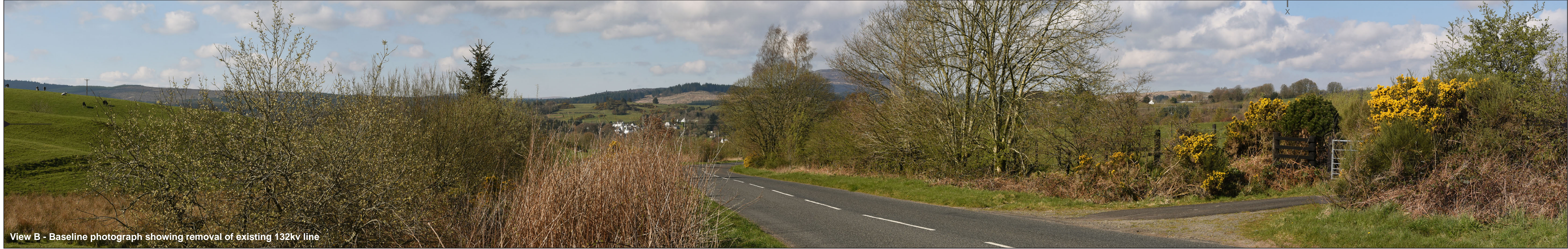
View B - Baseline photograph showing removal of existing 132kv line

This image provides landscape and visual context only